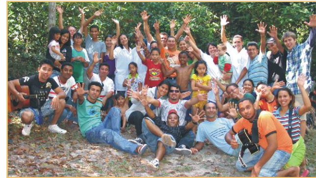
Four pastors, six families, and many hearty individuals – all Brazilians – comprise our ground-breaking team in Mato Grosso.